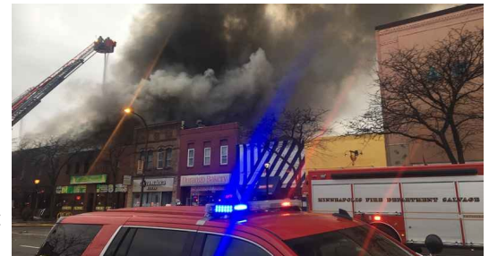
Smoke billows from apartments above two Central Ave businesses, El Taco Riendo, a Mexican restaurant, and Anelace Coffee Shop, on Mar 22, 2020. The sandstone building behind the tree at the right is the Arcana Lodge Masonic Center, rental home of Braden Lodge since Jan 2015.

On Sunday afternoon, March 22, 2020, a fire broke out in an apartment located above the El Taco Riendo Restaurant, located just four doors down the block from the Arcana Masonic Center in North-